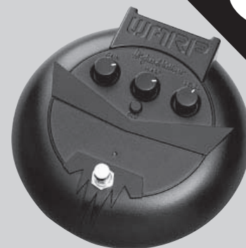
Roadtested Hughes & Kettner WARP FACTOR PEDAL